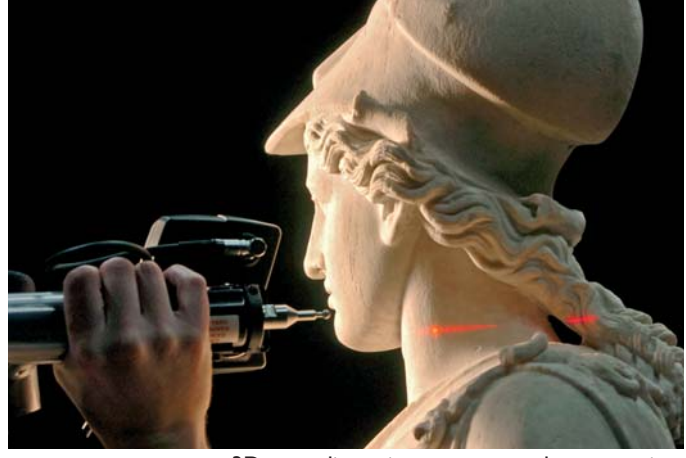
3D recording using non-contact laser scanning.

Laser scanning offers just one way in which the 3D surfaces of objects can be recorded. Pioneered in the automotive and aeronautical industries, this technology has found its way into heritage owing to its non-contact techniques, high accuracy and resolution.