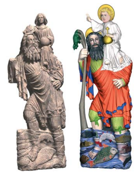
A computer model of the St Christopher sculpture, Norton Priory, Cheshire and a digital reconstruction of missing original features.

Technologies of the National Museums Liverpool, in collaboration with other cultural institutions, include the recording and visualisation of a Mesolithic fish trap excavated near the Tara Hill in Dublin, Ireland; and a Megalithic stone, carved in a circular pattern, unearthed in Heygate, West Yorkshire. A medieval figure of St Christopher in Norton Priory, Cheshire was also scanned and 3D data used to create a computer model in which missing original parts and painted decoration were reconstructed.