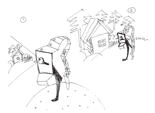
Rutopia 2. The initial sketch for the network and interaction. By moving one's head through the screen in the tree in the space I the user enters the remote space 2 in real time. Daria Tsoupikova

The research and artwork in Rutopia 2, a follow up to Rutopia, explores the relationship between the aesthetics of virtual environments, traditional arts and the effect of VR aesthetics on the user's perception and emotions. It examines how traditional art principles, such as balance, colour, repetition and rhythm, can enhance the navigation and interactivity in real-time, digital 3D environments. Rutopia 2 was designed for the exhibition on the CAVE® and C-Wall VR systems. A participant in the C-Wall presentation can interact with the project and navigate in the environment. The user's position in the virtual world is tracked from the glasses and wand trackers. When a person navigates and interacts with the virtual environment, messages are sent to the system and information is then streamed back into the C-Wall in real time.